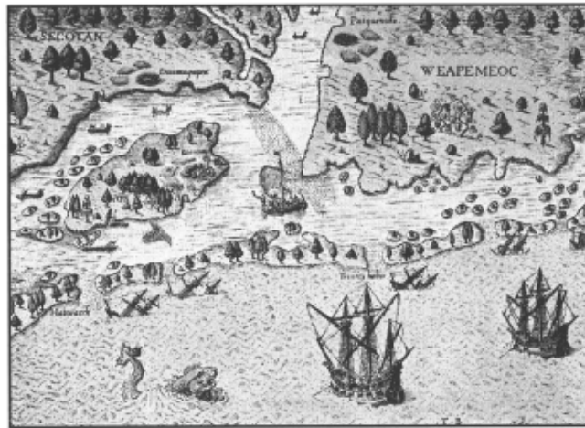
“Roanoke Landing, 1585”

Remarkably, the English kept coming – men, women, and children. The vast majority